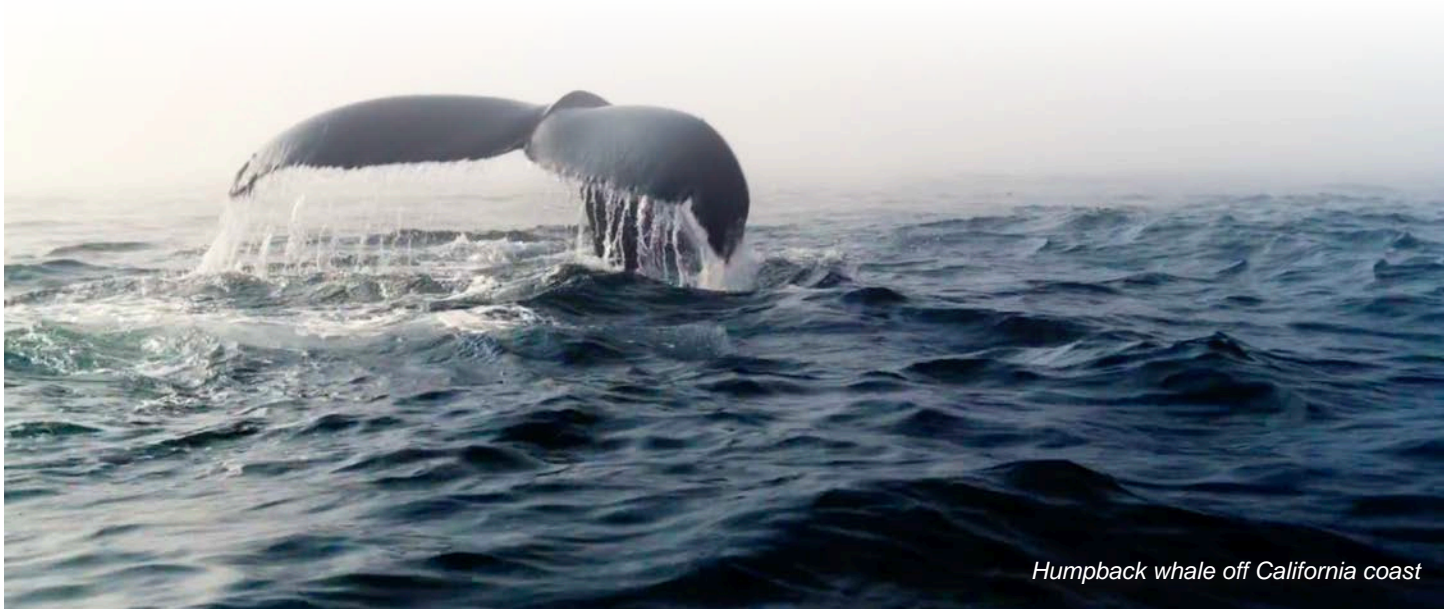
Humpback whale off California coast