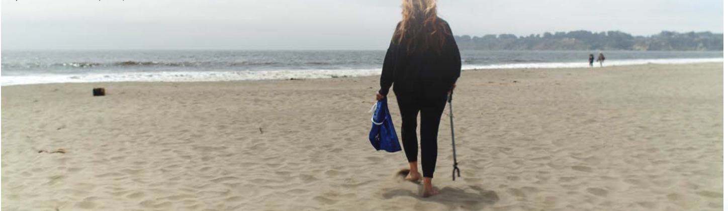
Tess walks along ocean shore collecting debris for her art.