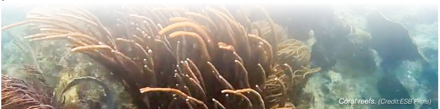
Coral reefs.

Corals that live in warm water environments like the US Virgin Islands are experiencing coral bleaching events, where rising ocean temperatures become hot enough to kill the living tissue inside corals, resulting in its death. When coral dies, other animals that make their home in the reef are also affected and either have to move, adapt or die. In addition to being habitats with extreme biodiversity, healthy coral reefs work as natural barriers, buffering shorelines from impacts from big storms, slowing waves and flooding impacts. Corals are also vulnerable to impacts of ocean acidification, where the chemistry of the ocean that has absorbed so much carbon dioxide is making it harder for animals like corals and shellfish to grow and live.