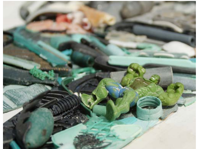
Heavy debris ends up on the seabed where it can impact the seafloor, and buoyant plastics float on the surface and risk being eaten by seabirds, fish and whales.

The only way to change this course is to “turn off the tap” of plastic being generated, used and disposed of. Plastic is made by oil, and oil subsidies for extracting and creating plastic products are a central part of this global issue. Cleanups bring attention to the issue, but until the debris flows stop, more will wash up on beaches around the world and sink to the seafloor. The more people become aware of the issue, the more people will demand for change. Tess Felix highlights the issue through her art.