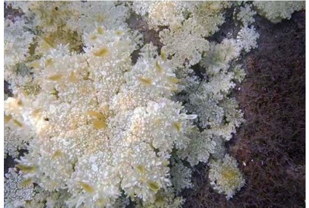
Coral reefs photographed by Barbara Crites in USVI (Credit:ESB Films)

B arbara Crites, fascinated by the US Virgin Islands, dove in at first to just take a look, and over time, became an expert snorkeler and citizen scientist by taking over 90,000 pictures of what lives underwater. She observed changes in the islands' coral reef habitats, and before too much damage occurred from extreme weather events, she documented the life on the reefs through photography and created an online platform for people to learn about the species that live there. The platform also serves as a living museum documenting what has lived on the reefs over time. She advocates for helping people connect to and care about the health of the ocean, and she raises awareness about the changes she has witnessed underwater around the US Virgin Islands.