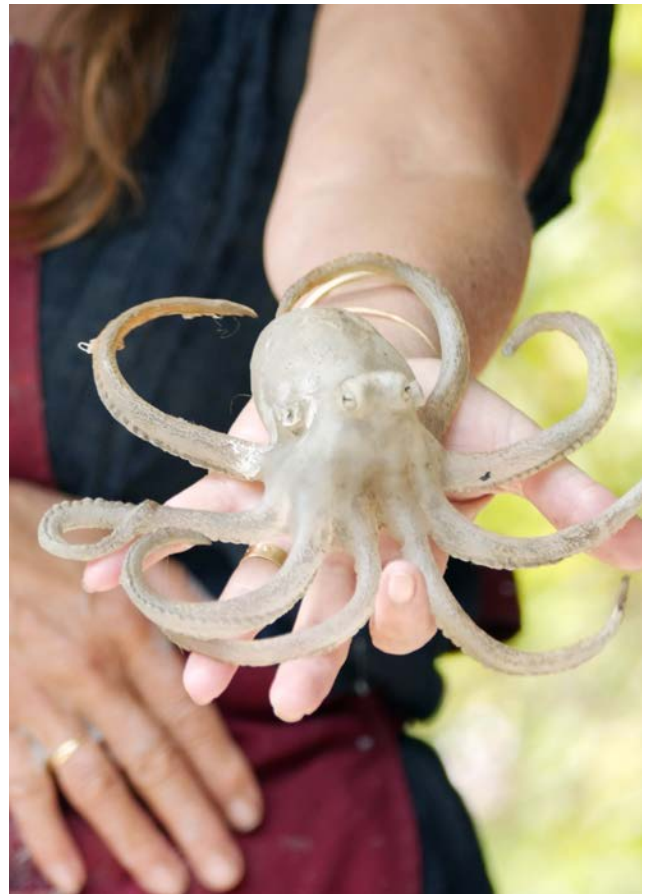
Plastic octopus found on the beach.