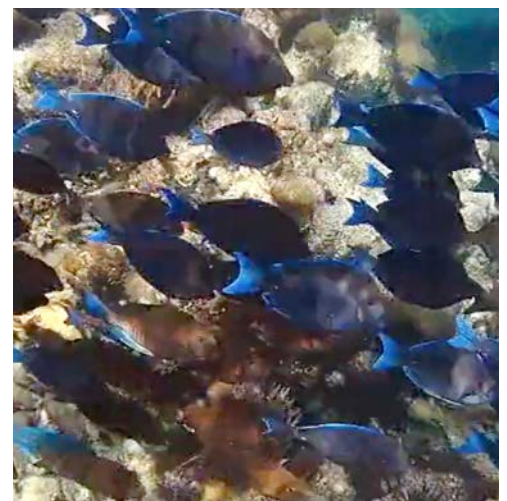
School of fish in coral reefs.